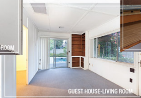
GUEST HOUSE-LIVING ROOM