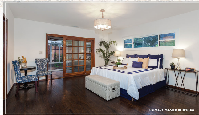
PRIMARY MASTER BEDROOM

Lastly, enjoy the backyard flanked with fruit trees and an outdoor Jacuzzi. This tastefully re-imagined home provides an extraordinary level of comfort. If you are looking for a home that reflects the discerning purchaser's personality and taste, exudes charm, character, and craftsmanship, this is the perfect home for you! Don't miss out on the opportunity to own this home of your dreams.