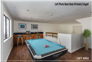
Loft Photo Have Been Virtually Staged