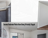
Second Bedroom Photo Have Been Virtually Staged