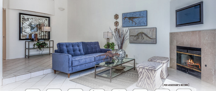
(PER ASSESSOR'S RECORD)

Loft Area and Second Bedroom photos have been virtually staged. 閣樓及第二間臥室的照片均經過如假亂真電腦合成攝錄, 僅供買家想像空間參考用。