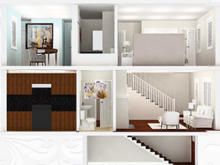
3D DOLLHOUSE VIEW