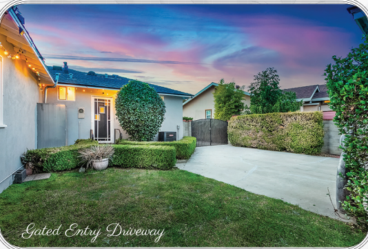
Gated Entry Driveway