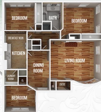
3D DOLLHOUSE VIEW