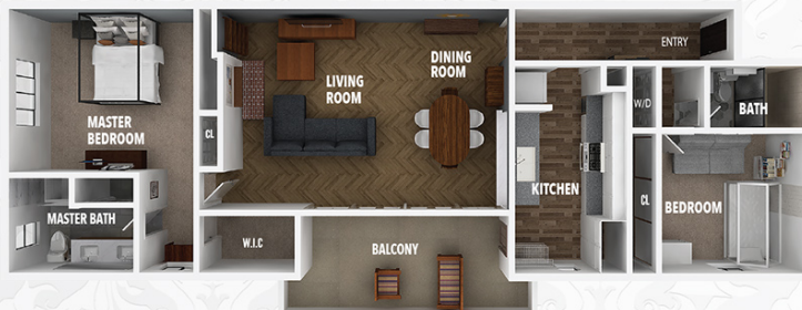
3D DOLLHOUSE VIEW