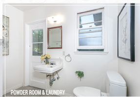
POWDER ROOM & LAUNDRY