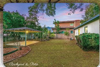
Backyard & Patio