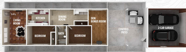
3D DOLLHOUSE VIEW