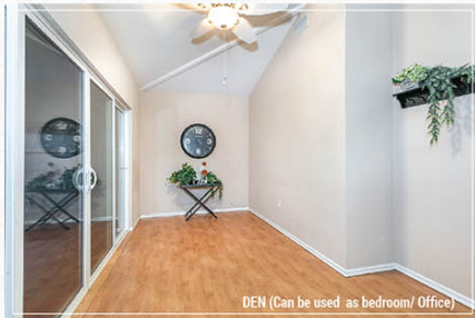
DEN (Can be used as bedroom/ Office)