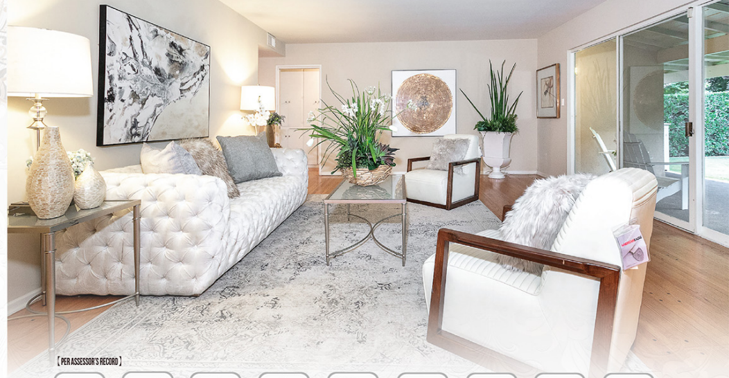
[ PER ASSESSOR'S RECORD ]