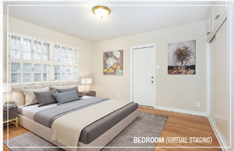
BEDROOM (VIRTUAL STAGING)