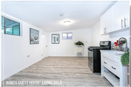
BONUS GUEST HOUSE - LIVING AREA