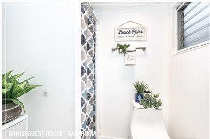
BONUS GUEST HOUSE - BATH

*THIS LIVING ROOM PHOTO HAVE BEEN VIRTUALLY STAGED FOR A REFERENCE ONLY