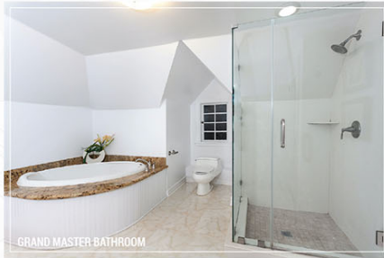
GRAND MASTER BATHROOM