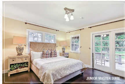
JUNIOR MASTER SUITE