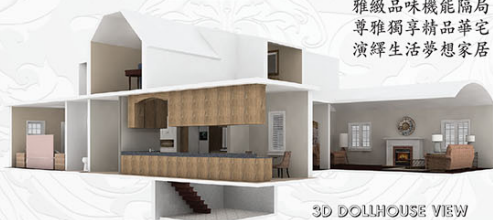
3D DOLLHOUSE VIEW