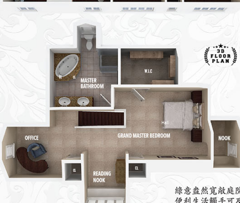
3D FLOOR PLAN