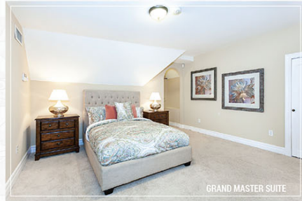
GRAND MASTER SUITE