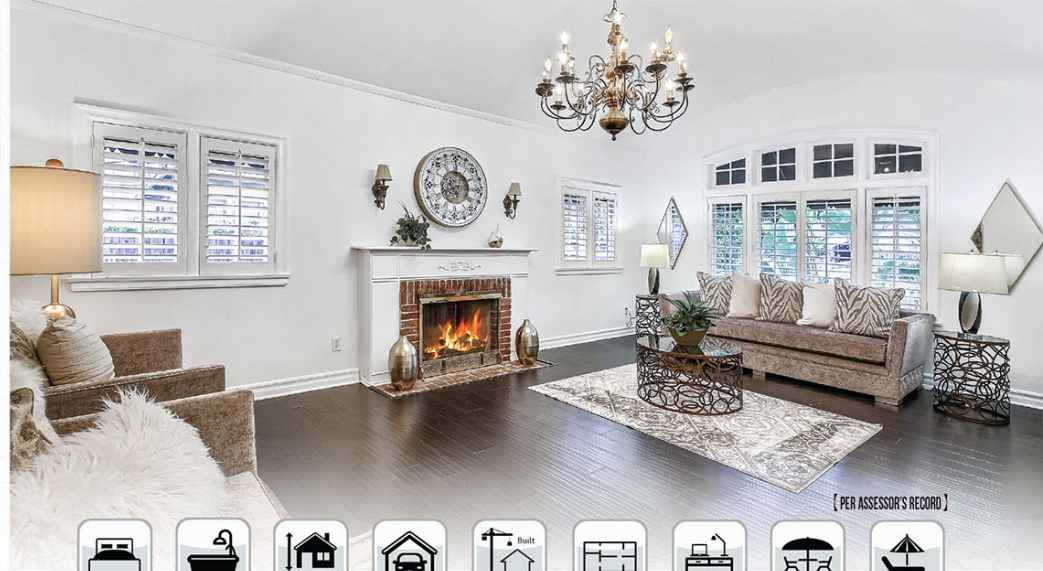
(PER ASSESSOR'S RECORD)