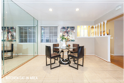
KITCHEN EAT-IN AREA