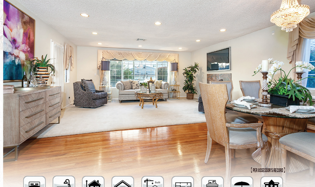
(PER ASSESSOR'S RECORD)