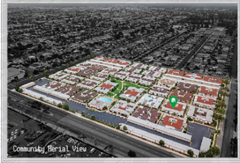
Community Aerial View