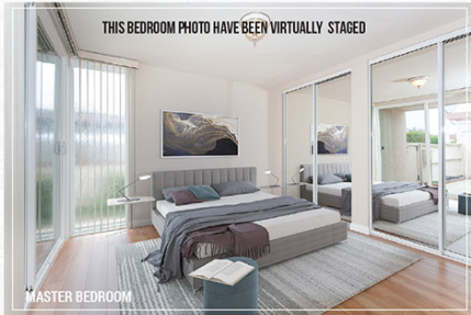
THIS BEDROOM PHOTO HAVE BEEN VIRTUALLY STAGED