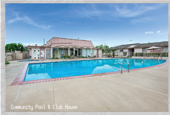
Community Pool & Club House