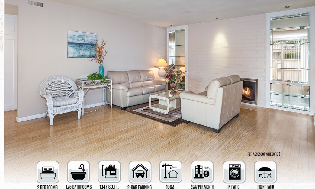
[ PER ASSESSOR'S RECORD ]