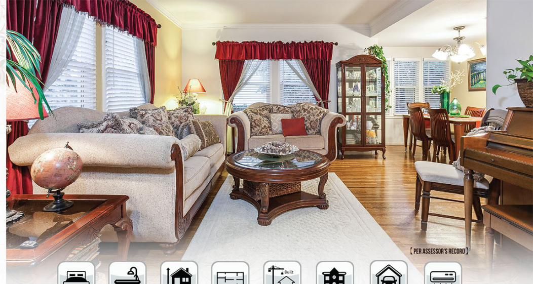
[ PER ASSESSOR'S RECORD ]