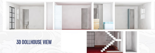
3D DOLLHOUSE VIEW