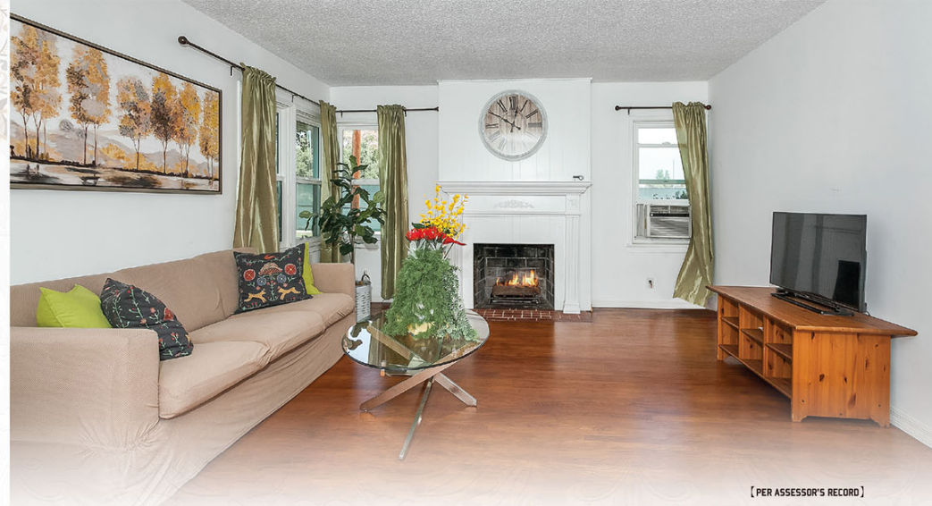
[PER ASSESSOR'S RECORD]