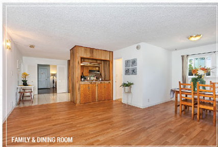
FAMILY & DINING ROOM