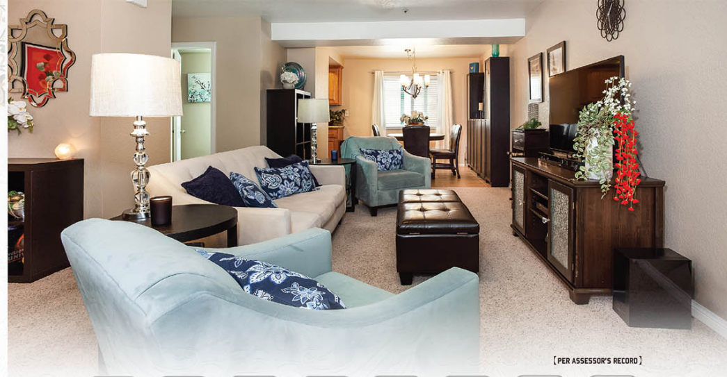
[PER ASSESSOR'S RECORD]