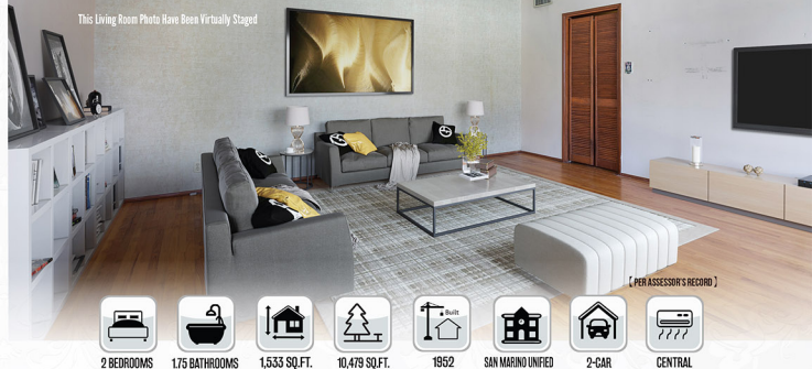
This Living Room Photo Have Been Virtually Staged

This one-story single family home is situated in the most sought-after and prestigious neighborhood of San Marino, with access to the award-winning National Blue-Ribbon San Marino Schools. The new owner will enjoy this home that offers maximum living convenience, just blocks away from San Gabriel Blvd and Huntington Drive with a variety of restaurants, retail stores, shops, cafes, supermarkets and banks. Located near schools, public library, Country Club, Huntington Library, and Lacey Park. It is also commuter friendly with access to all the major freeways and within easy reach of public transport.