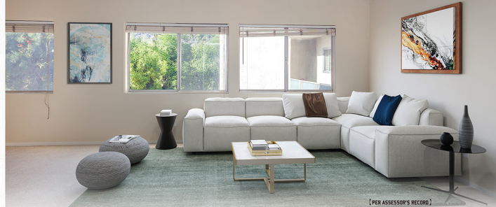
[PER ASSESSOR'S RECORD]