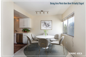
Dining Area Photo Have Been Virtually Staged