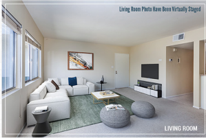
Living Room Photo Have Been Virtually Staged