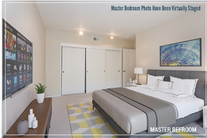
Master Bedroom Photo Have Been Virtually Staged