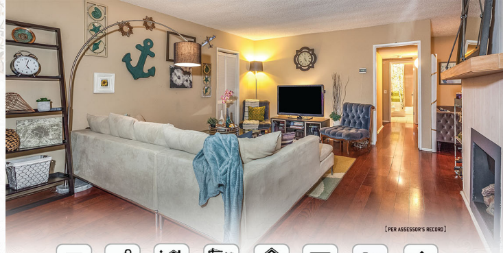
[PER ASSESSOR'S RECORD]