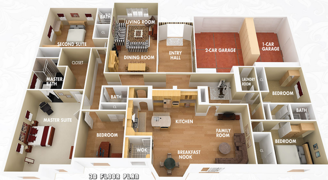
3D FLOOR PLAN