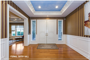
FORMAL ENTRY HALL