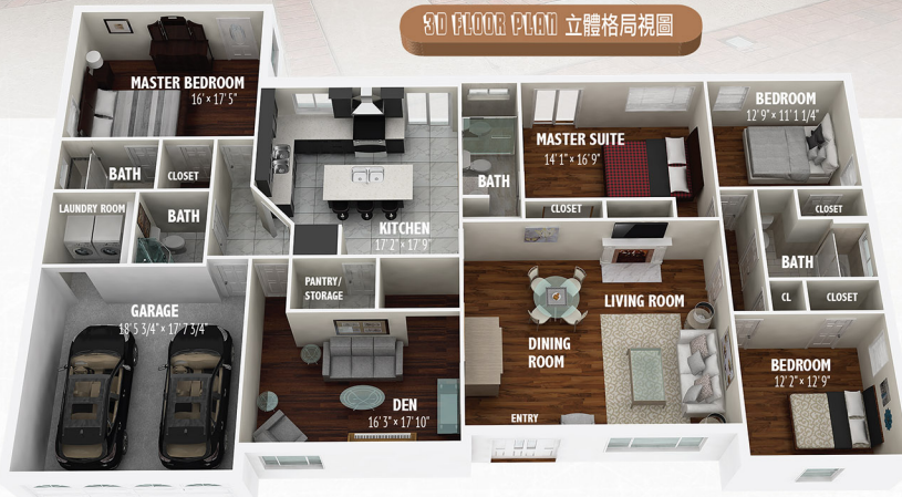
80 FLOOR PLAN 立體格局視圖

這棟單層樓高品質建造的獨立屋坐落於天普市安靜街道，房子擁有82英尺長寬闊的面積，並有半圓型車道及可停放兩台車的连接車庫和安全開門出入，新屋主將可以享受這個理想位置所帶來的便利設施，靠近購物、餐館、零售商店、咖啡館、銀行和家得寶連鎖。這棟精心打造的家室內格局規劃有4個房間、4間衛浴間、客廳、家庭起居室、廚房、飯廳、洗衣間在車庫，總計大約2,252平方英尺的生活空間。這個美麗的家園內做了很多升級現代化的設備，適合各種舒適和豪華的生活方式。其中功能包括如新的屋頂、嵌入隱藏式照明燈、太陽能電池板、雙面節能窗戶、中央空調及暖氣系統、預接線安全攝影機、軟水器系統、飲用水過濾系統、即熱式熱水器、複合式木地板、和貫穿整棟房子的優雅白色頂冠裝飾條和底飾防踢條及護板牆。（因為有裝設太陽能電池板每個月電費非常低）溫馨的客廳和飯廳寬敞開放設計概念，讓室內動線一體簡約也營造了溫馨氛圍和愉快環境，空間結構更適合招待訪客完美場所，也是工作一天後放鬆的最佳地點，相鄰的飯廳是您與家人們享受親密用餐的完美空間。此外還有一間家庭起居室，也可當成家庭娛樂房或者設計成客房使用。經過精心裝修宛如專業級的廚房，有著所有美食廚師所喜愛的各種靈感設計在這裡都能找到，這裡提供了大量的櫥櫃、白色石灰石檯面、防水後擋板、廚房中島、大型儲藏室、日光天窗讓廚房充滿了豐富自然光。這個家共設有4間尺寸合宜的房間和四間升級過的衛浴間，其中還包括二個寬敞的主臥套房並有自己連接的主衛浴間，二個主臥套房都可以通往私人後院。這裡佔地面積有11,149平方英尺，您將可以在私人後院享受鳥兒鳴叫聲的大自然樂園，後院還有閃閃波光粼粼的游泳池和水療池、休閒區、魚塘、儲存棚、兩旁都有許多果樹、還有覆蓋的露台提供放鬆身心聚會好地點，為這個高雅的家提供了無比卓越的舒適度，精心維護高端升級屋況佳，這棟理想地段的獨立華宅，可以讓您享受天普市提供的最舒適便利的生活方式，如您千萬不要錯過擁有這個夢寐以求的溫馨家園的大好良機。請到我們網站內www.4940Doreen.com有3D立體格局圖、3D實景互動看房網站、HD高清空拍及室內動畫移動視頻影片加專業語音導覽。