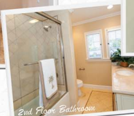
2nd Floor Bathroom